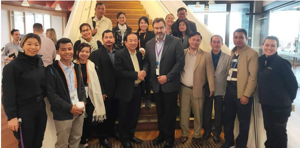
Photo 3: Cambodian delegation touring South East Water during their visit to Ozwater'19

psmith@awa.asn.au if you are interested in joining the program. Further information on the delegation to Cambodia Water can be accessed at: Cambodia