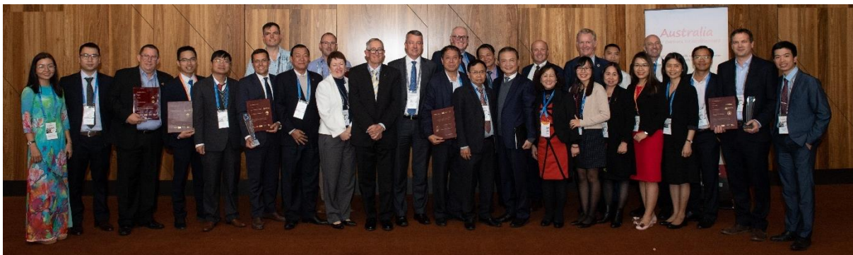
Photo 1: Australian and Vietnam utilities with the AWP CEO, AWA President and Vietnam Ambassador to Australia receiving their awards at Ozwater’19.