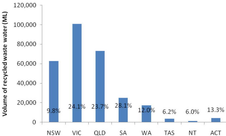
Figure 2: Direct Potable reuse: four configurations of water sources, treatment processes and blending